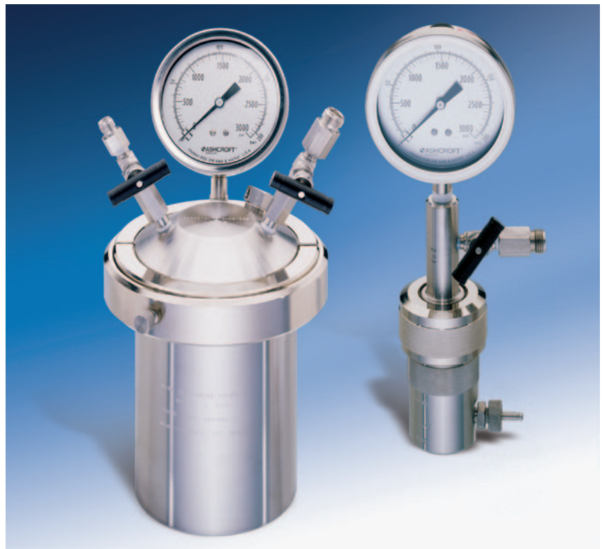
Model 4635 and Model 4639 Parr Cell Disruption Vessels

The larger vessels, 4636, 4637, and 4638, are intended for large volume applications. Users are urged to run preliminary experiments in the 4635 Vessel to confirm the suitability of the procedure before scaling up to these larger sizes.