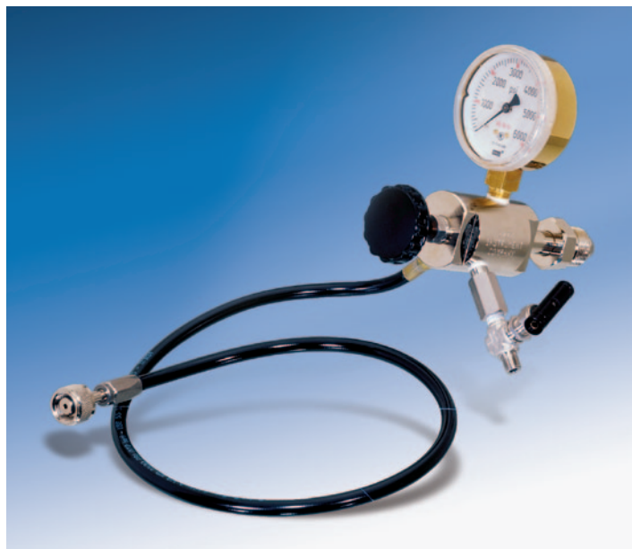
1831 Nitrogen Filling Connection

Instead of pouring the cell suspension directly into the vessel cylinder, most users will find it convenient to hold the sample in a beaker or test tube which can be placed inside the larger vessels. A supplementary container is particularly useful when working with small samples. As a general rule, the capacity of the inner container should be approximately twice the volume of the suspension to be treated. Larger samples may, of course, be poured directly into the cylinder. If an inner container is used, it must be positioned so that the dip tube leading to the release valve reaches to the very bottom of the container. Plastic test tubes, centrifuge tubes and beakers work well as auxiliary sample holders. They are not only unbreakable but they also can be floated on ice water within the vessel to keep the suspension cool during equilibration and to bring the bottom of the sample holder up to the tip of the dip tube to ensure complete sample recovery.