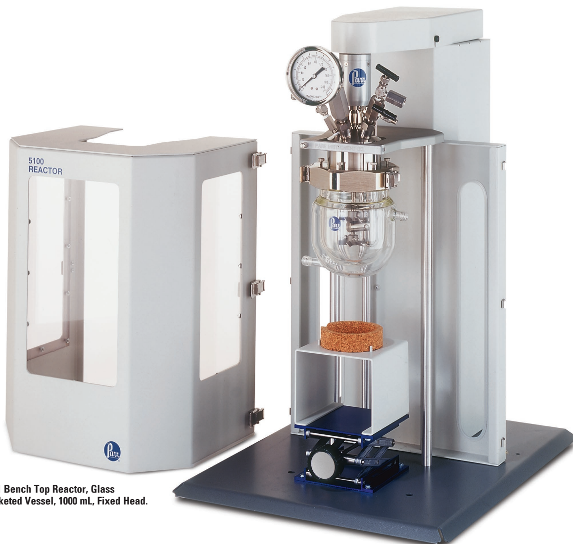
5111 Bench Top Reactor, Glass Jacketed Vessel, 1000 mL, Fixed Head.