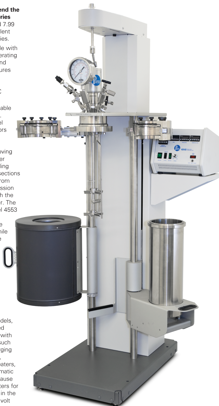
Model 4554 Floor Stand Reactor, Two Gallon, Fixed Head, Pneumatic Lift, Hinged Split-Rings, opened to show Internal Fittings and Serpentine Cooling Coil, with 4848 Reactor Controller shown with optional Expansion Modules.

The 1 gallon size is usually recommended for high viscosity polymer studies. An optional bottom drain valve may be added for convenient product recovery. As with the smaller floor stand models, these larger, self-contained systems can be equipped with a variety of attachments, such as condensers, solids charging ports, bottom drain valves, special motors, custom heaters, jacketed vessels and automatic valves and regulators. Because of the higher wattage heaters for these reactors, all models in the 4550 Series require a 230 volt power supply.