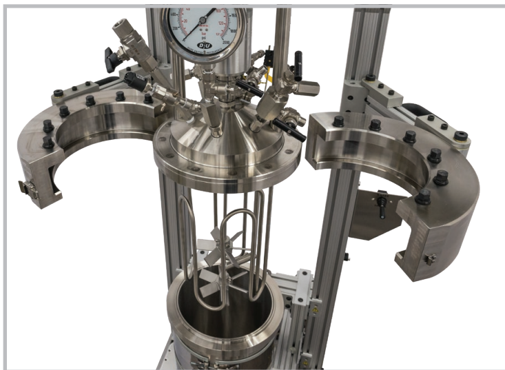
Hinged Split-Rings open to reveal Serpentine Cooling Coil, with Heater and Vessel lowered via Pneumatic Lift.

Modified versions of these units are available with higher working pressures and temperatures.