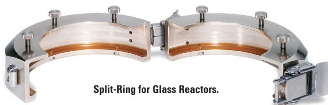
Split-Ring for Glass Reactors.