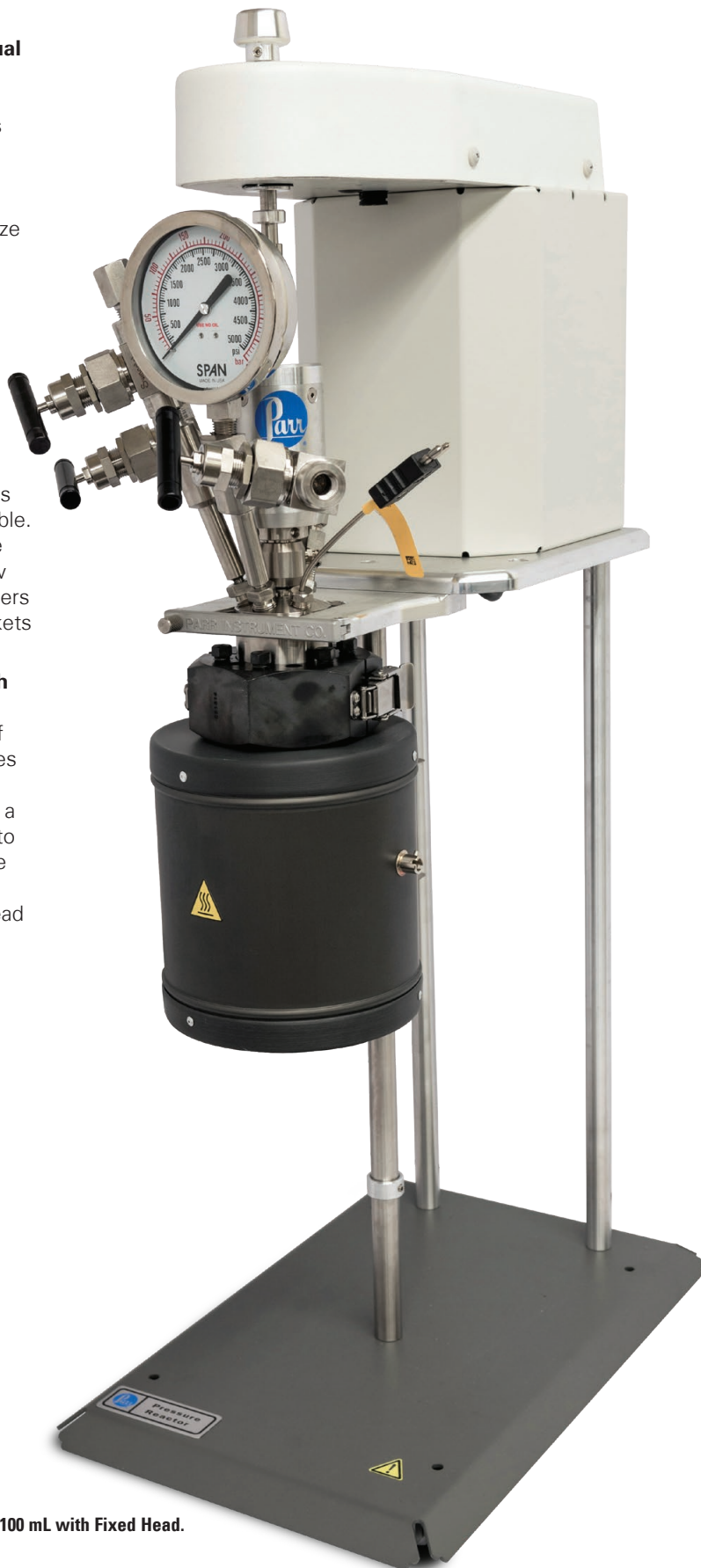
4598 HP/HT Micro Reactor, 100 mL with Fixed Head.

These micro reactors can be easily converted from one size to another by simply substituting a larger or smaller cylinder and the corresponding internal fittings. The support system can also be readily adapted to accept any of the vessels from the 4560 Mini Reactor Series. The opportunity to modify these small reactors is restricted because of the limited head space available.