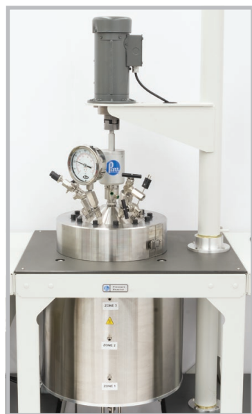
5 Gallon Stirred Vessel in stand with stirrer engaged.