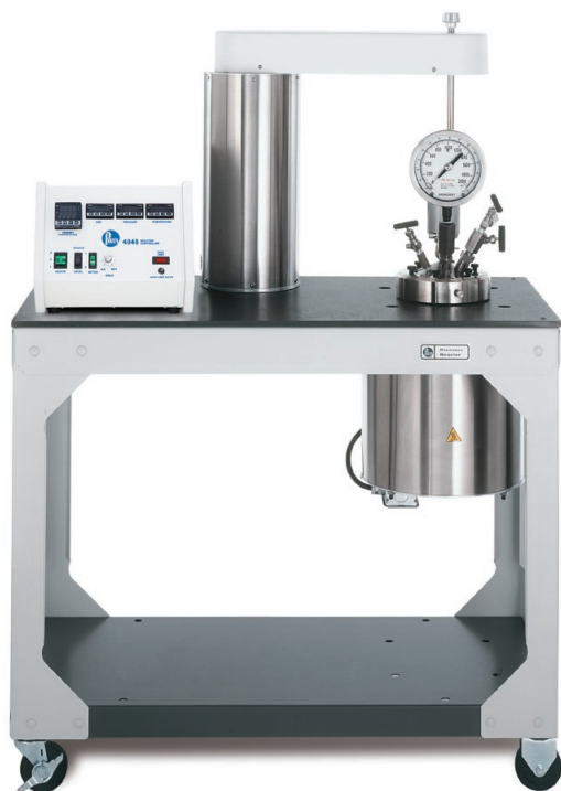
4532 Moveable Head on Moveable Cart, 2000 mL, and a 4848 Temperature Controller with optional Expansion Modules.