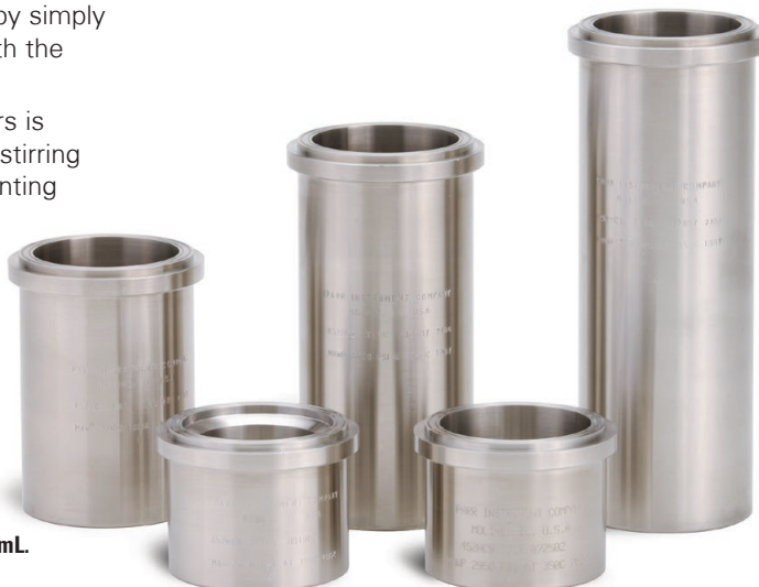
4560 Reactor Vessels from left to right, 300 mL, 100 mL, 450 mL, 160 mL, and 600 mL.