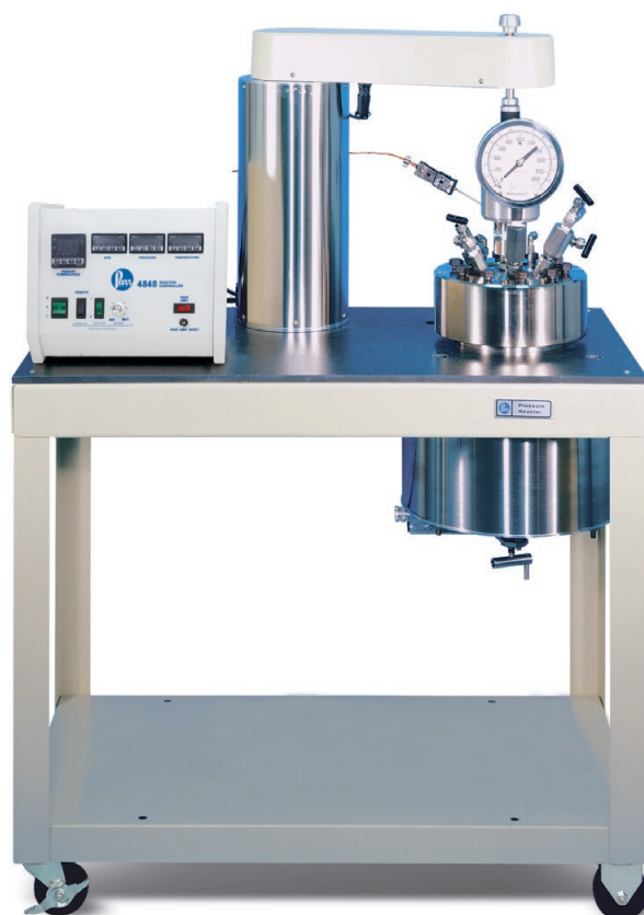
4551 Moveable Head Reactor on Moveable Cart, 1 Gallon, with Bottom Drain Valve, and a 4848 Temperature Controller shown with optional Expansion Modules.

The innovative Parr Hinged Split-Rings on the 4553 and 4554 add to a safe vessel removal routine. Simply loosen the compression bolts, unlatch the split-ring closures, and pivot the split-rings out of the way.