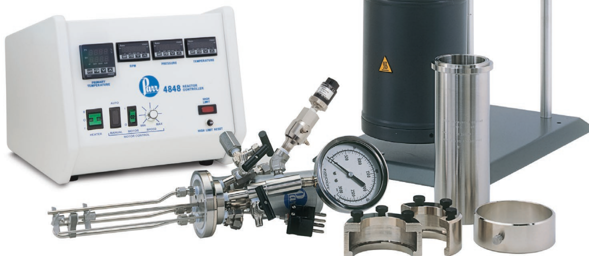
Model 4563 Bench Top Mini Reactor, 600 mL, Moveable Head, PTFE Flat Gasket Seal, with vessel disassembled, and a 4848 Controller shown with optional Expansion Modules.