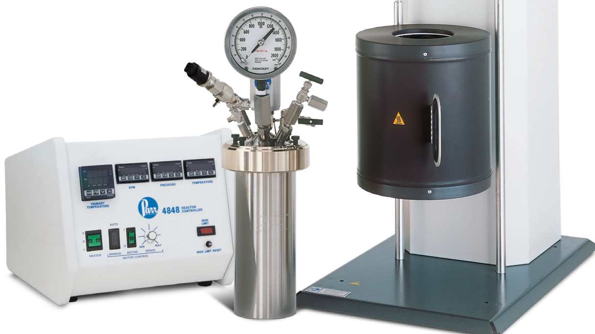
Model 4526 Bench Top Reactor, 2000 mL, Moveable Head, and a 4848 Controller shown with optional Expansion Modules.