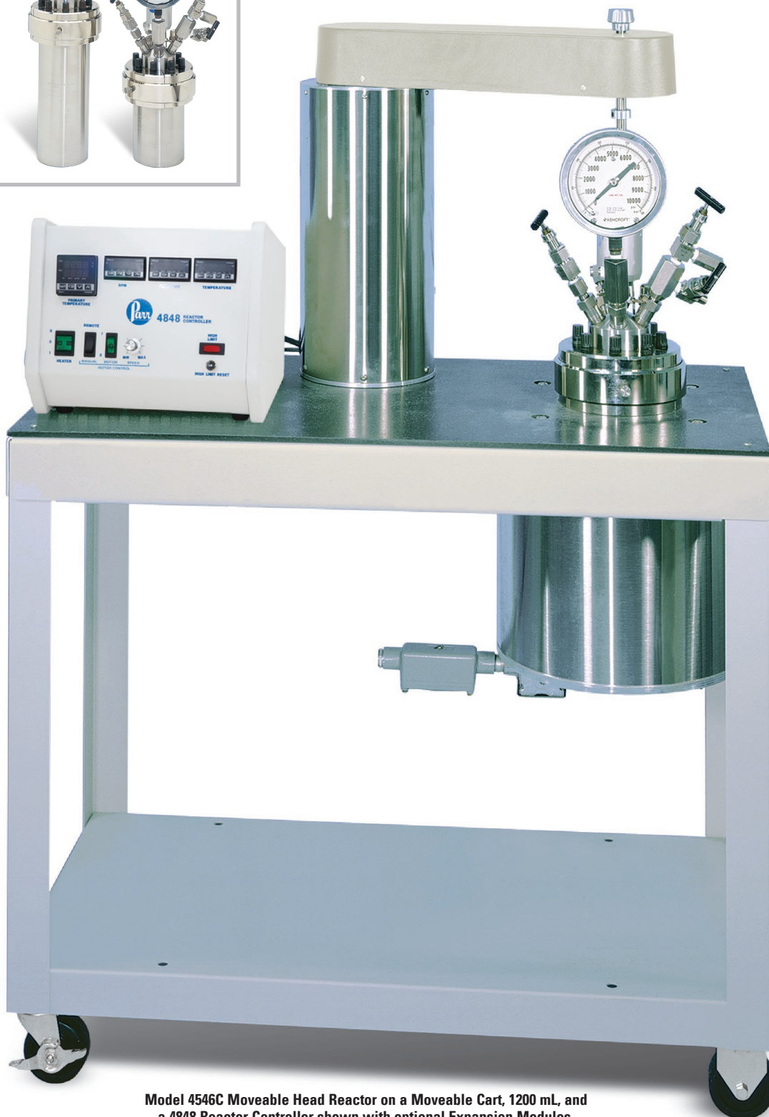
Model 4546C Moveable Head Reactor on a Moveable Cart, 1200 mL, and a 4848 Reactor Controller shown with optional Expansion Modules.