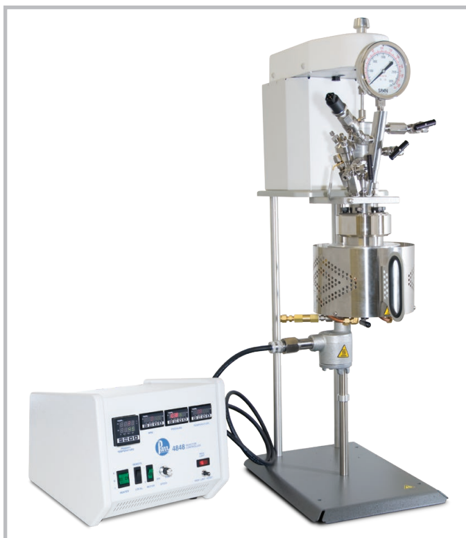
4566 Bench Top Mini Reactor, 300 mL, Fixed Head, with Aluminum Block Heater, and a 4848 Controller shown with optional Expansion Modules.