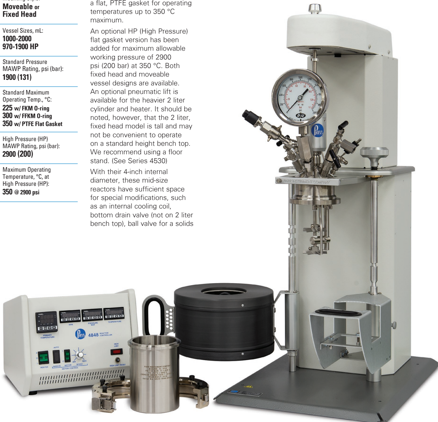
Model 4523 Bench Top Reactor, 1000 mL, Fixed Head, open to show Internal Fittings, and a 4848 Controller shown with optional Expansion Modules.

with viscosities up to 25,000 centipoise. For heavier stirring loads, these reactors can be equipped with larger magnetic drives, more powerful motors, and drive trains capable of delivering additional stirring torque.