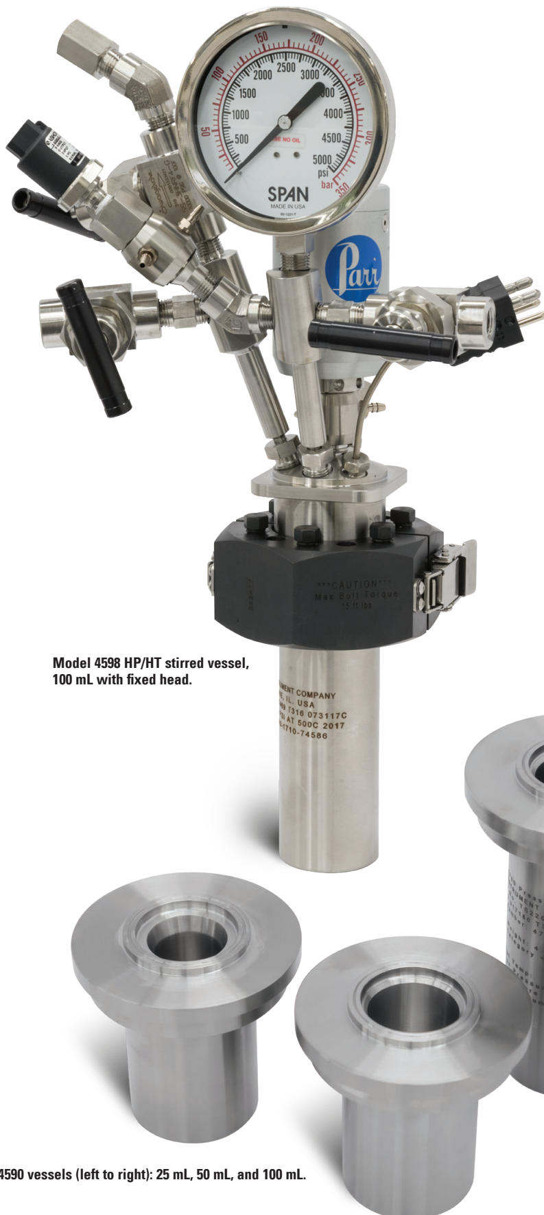
Model 4598 HP/HT stirred vessel, 100 mL with fixed head.