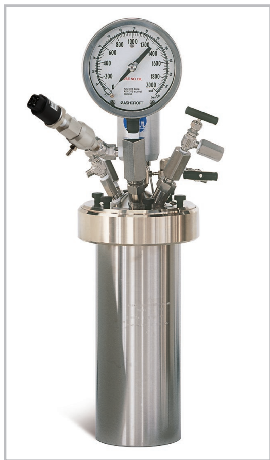
2000 mL Moveable Vessel