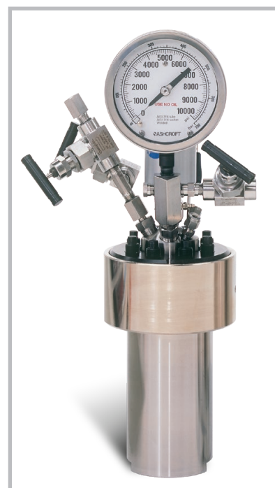
Model 4575B High Pressure/High Temperature 500 mL Moveable Vessel Assembly.