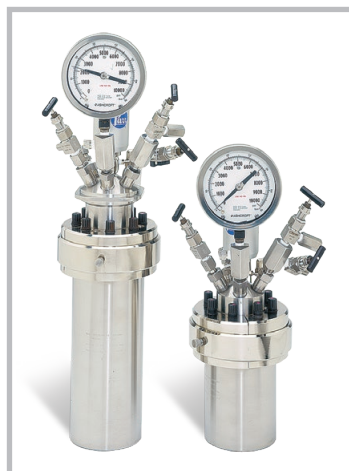
1200 mL Fixed Head, and 600 mL Moveable Reaction Vessels.