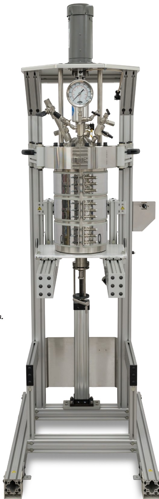
4557 Floor Stand Reactor, 5 Gallon, Fixed Head, 3-zone Band Heater, with Split-Rings and Pneumatic Lift.