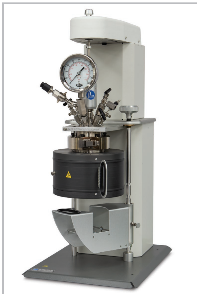
Model 4523 Bench Top Reactor, 1000 mL, Fixed Head