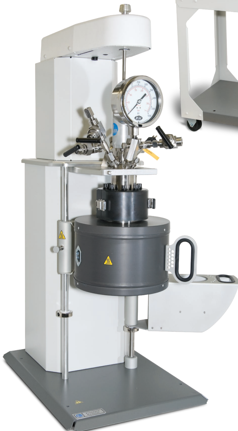
Model 4576A HP/HT Bench Top Reactor, 250 mL Vessel with Fixed Head.