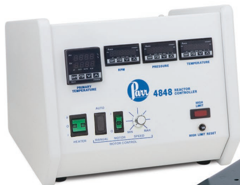
Model 4544 High Pressure Bench Top Reactor, 600 mL, Moveable Head, with heater lowered, and a 4848 Controller shown with optional Expansion Modules.