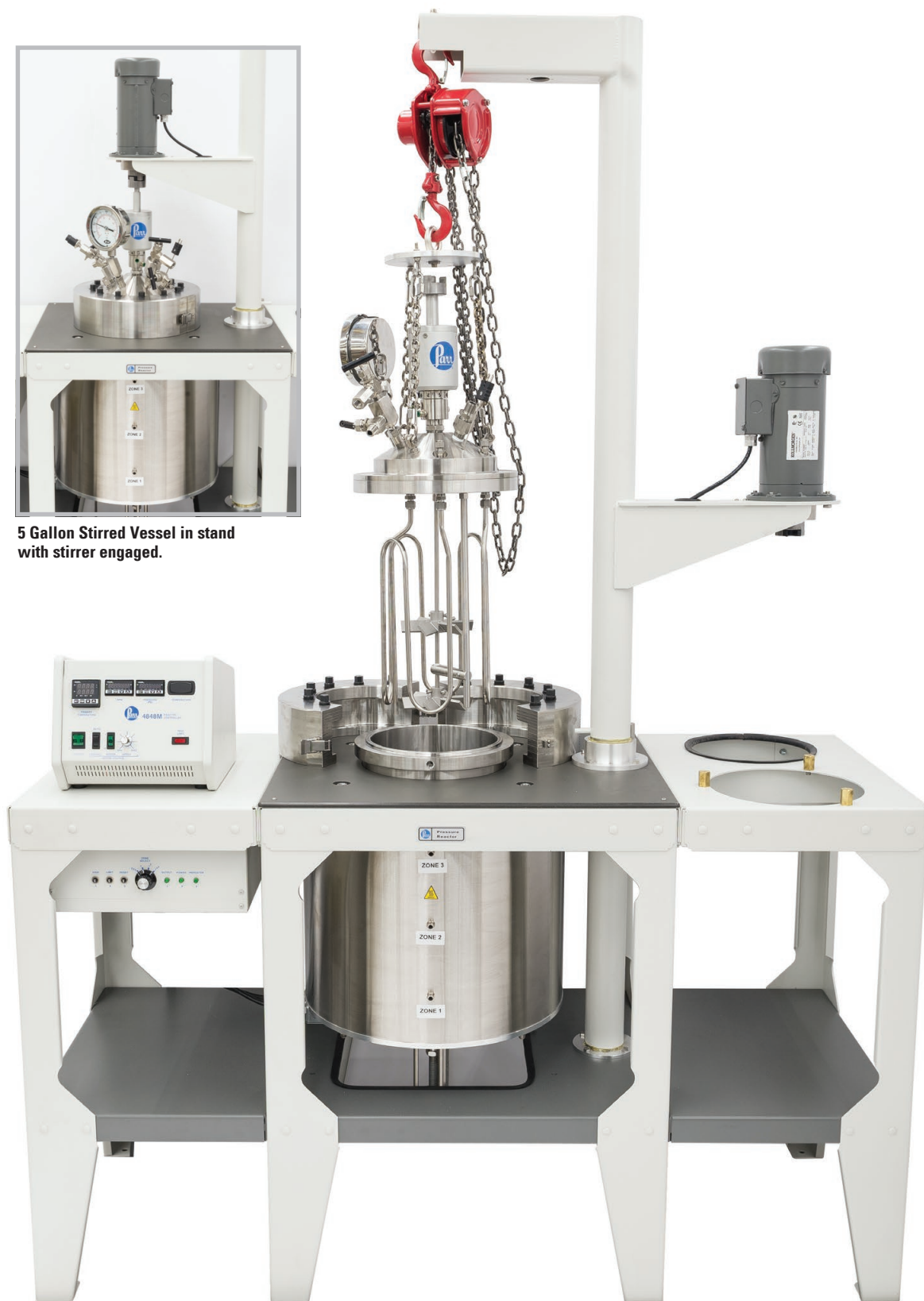
4555 Table Floor Stand Reactor, 5 Gallon Moveable Vessel with Head removed from Vessel, Manual Hoist, and a 4848M Controller.