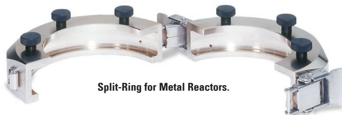
Split-Ring for Metal Reactors.