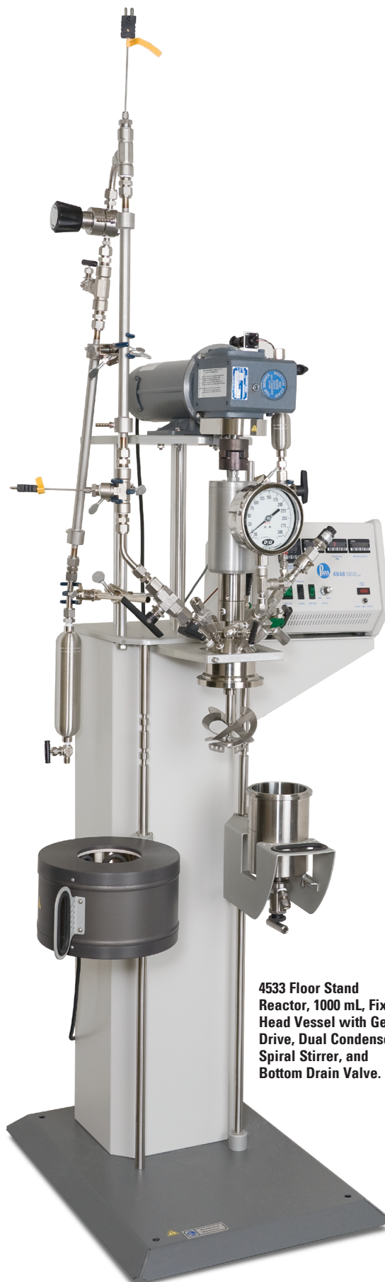
4533 Floor Stand Reactor, 1000 mL, Fixed Head Vessel with Gear Drive, Dual Condenser, Spiral Stirrer, and Bottom Drain Valve.