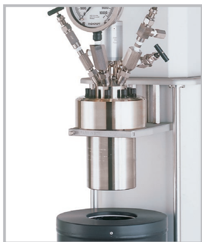
The moveable head is best when the user prefers to remove the entire reactor in one piece after running the operation.