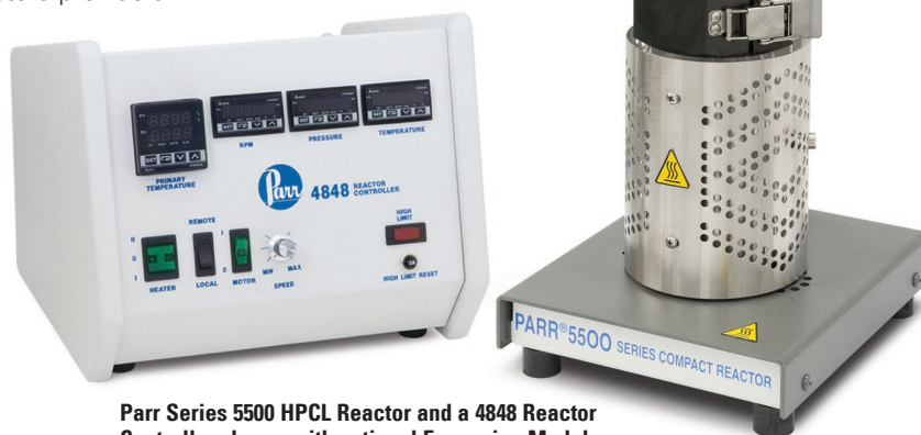
Parr Series 5500 HPCL Reactor and a 4848 Reactor Controller shown with optional Expansion Modules.

The Series 4848 Controller used with the standard Parr line of medium and high pressure reactors is also furnished for use with these reactors. The 4848 offers the user options for redundant temperature sensor and alarm, digital pressure